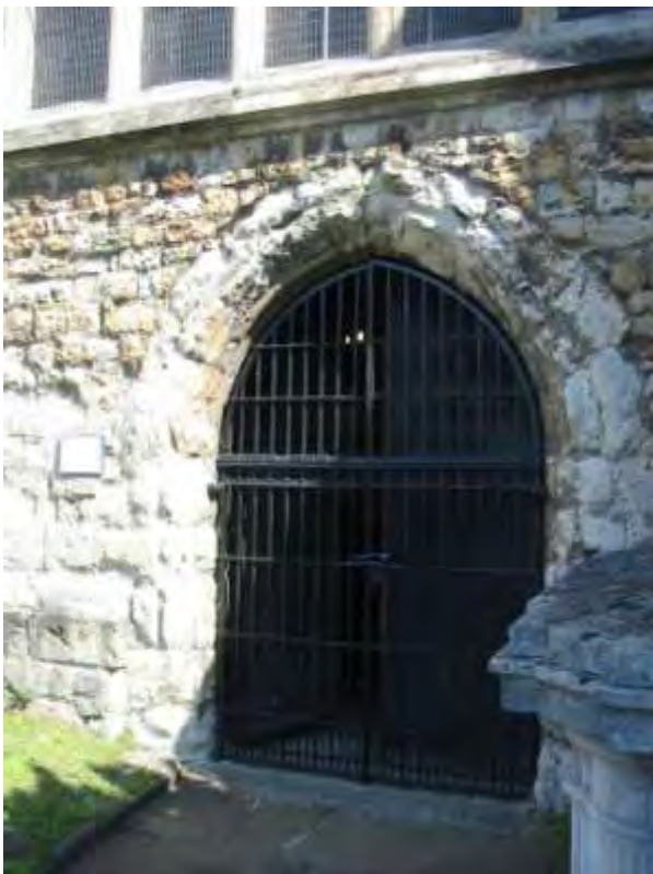
Stone deterioration around the West Gable door