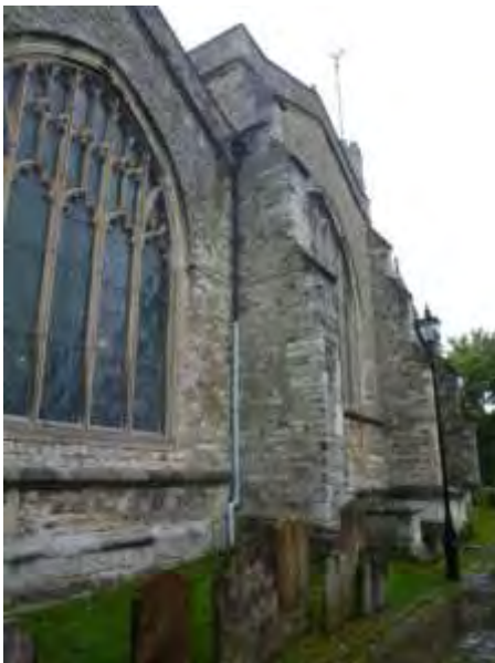
General view of west gable