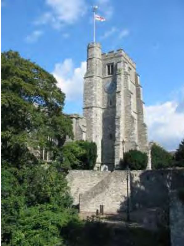
General view from South West