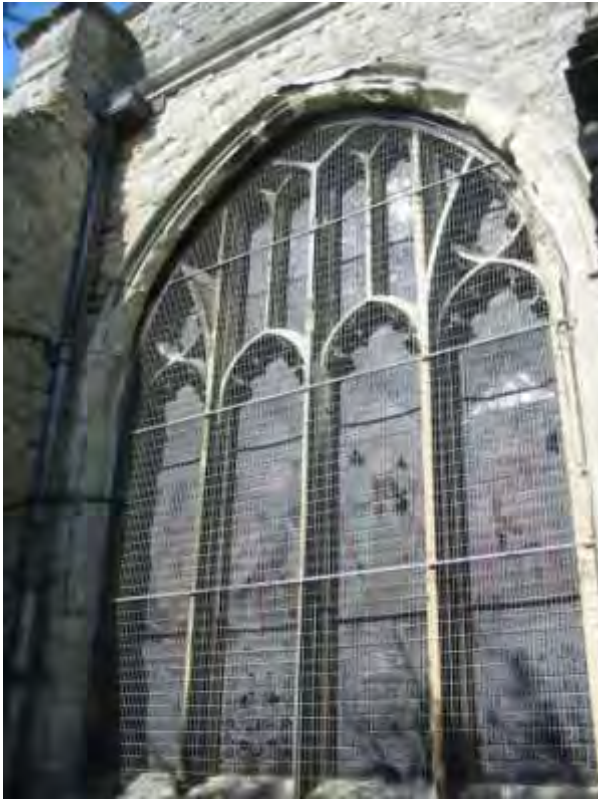
Vousoir decay to the Nave South Aisle Window