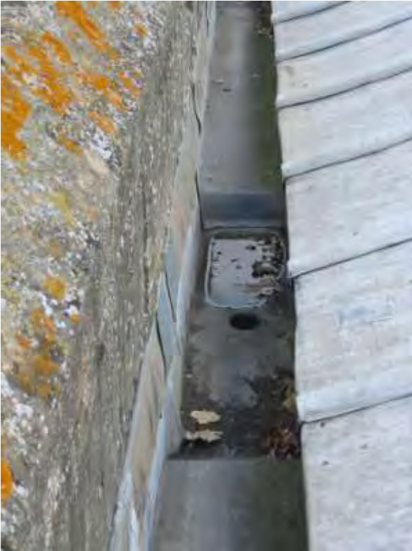
Ponding caused by decaying gutter supports on the Nave roof