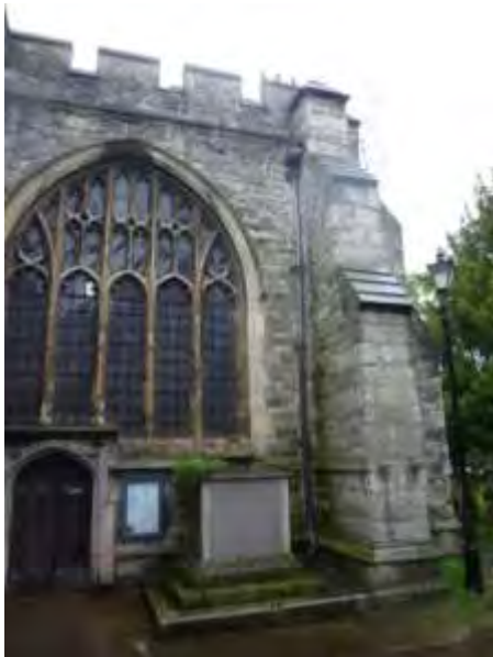
South Window to south chancel aisle