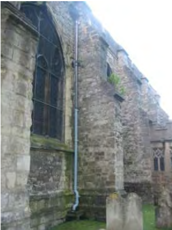
Stone work to the Nave North Aisle