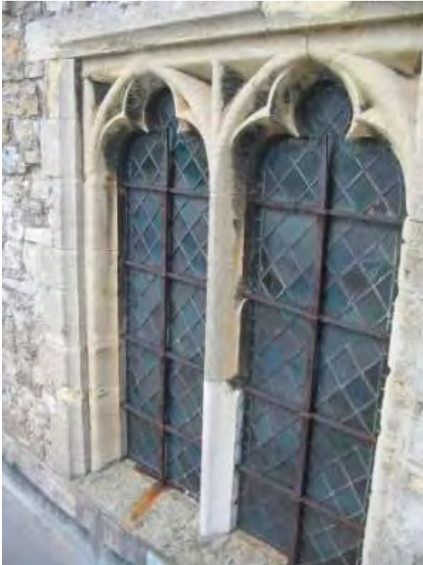
Rusting Ferramenta to South Nave Clerestory