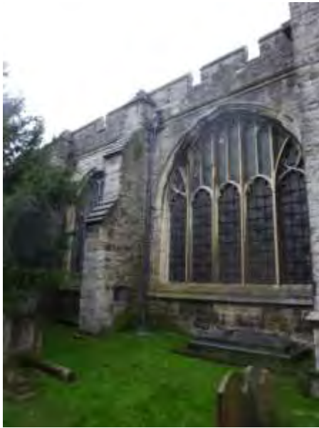
Organ Loft Window