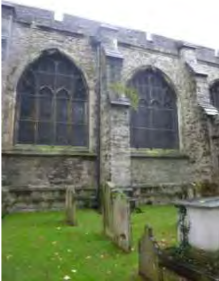
Vegetation growth in the north nave aisle