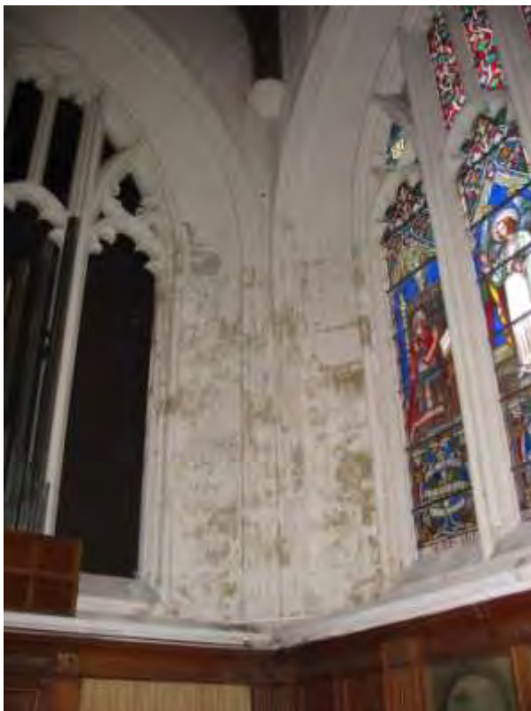
Water damage to the walls – South East corner of the nave south aisle