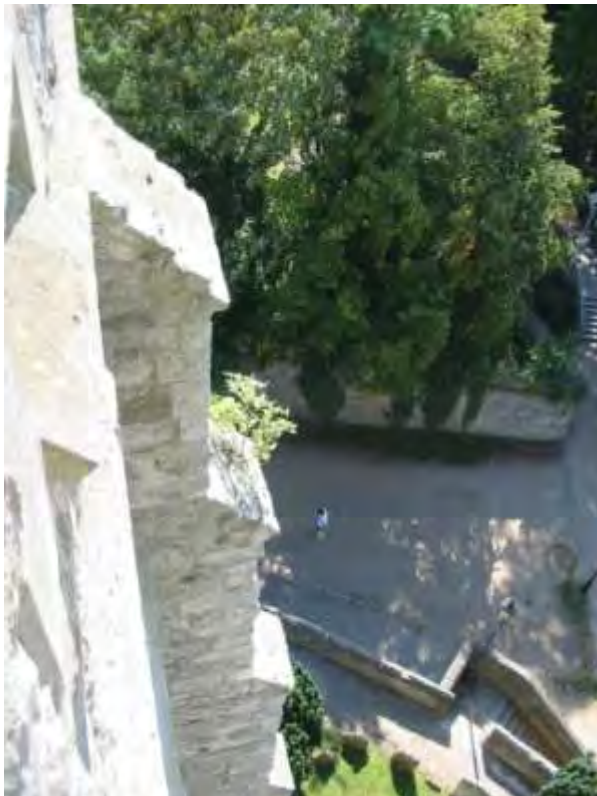
Vegetation growth in the Tower Buttress