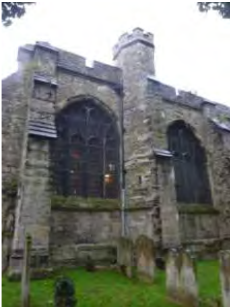
Stone decay in the north aisle access turret