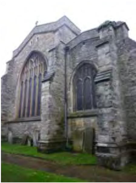
Blocked hopper at east gable of north aisle