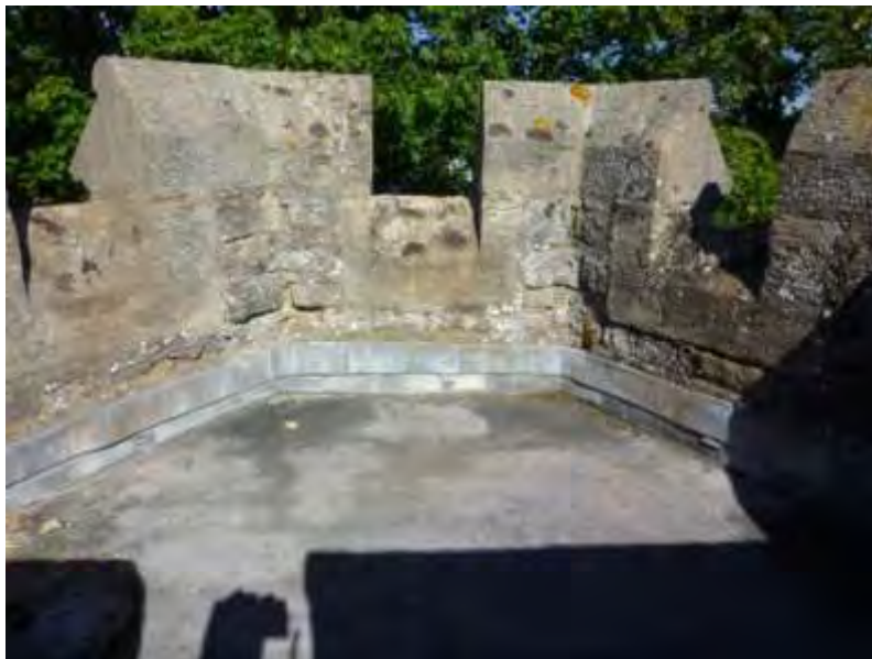
North aisle access turret roof