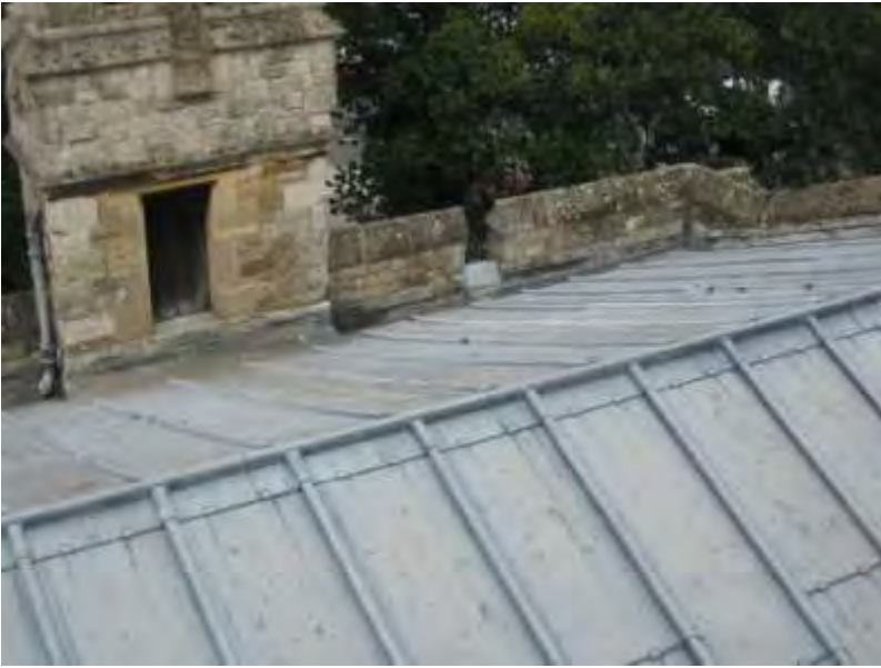
The Nave North Aisle roof looking North