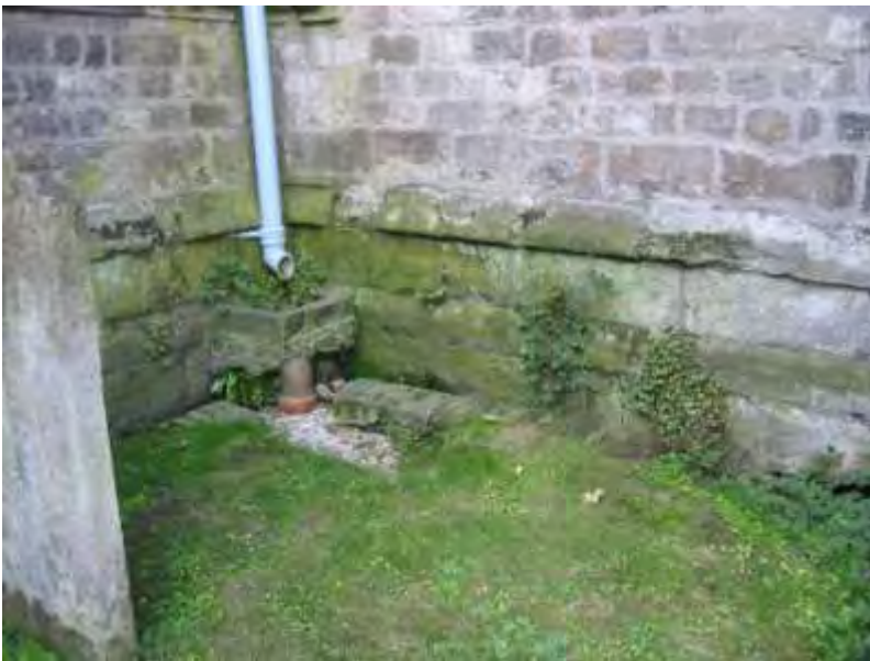
Defective gully and drainage to the East end of the Nave North Aisle