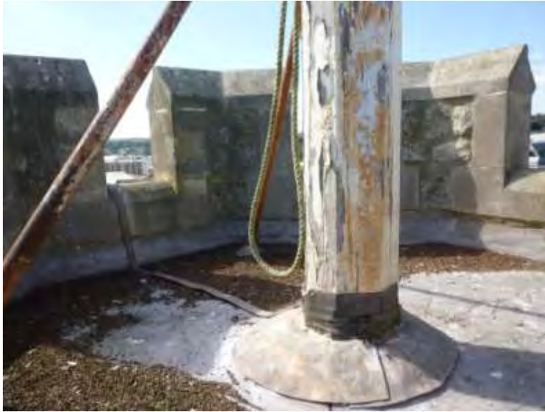
Flagpole turret roof